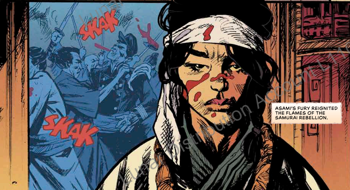
ASAMI'S FURY REIGNITED THE FLAMES OF THE SAMURAI REBELLION.