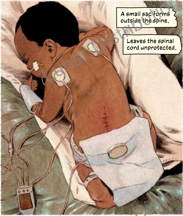
A small sac forms outside the spine.