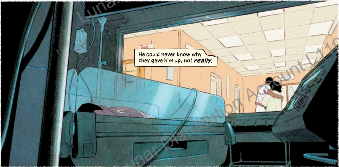
He could never know why they gave him up, not really .