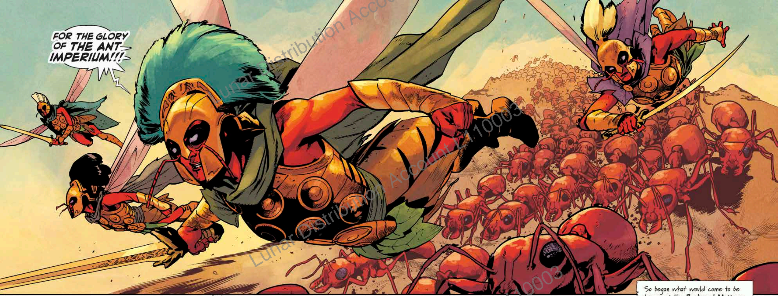
So began what would come to be known as the Rootguard Massacre.